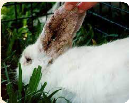
Ear canker