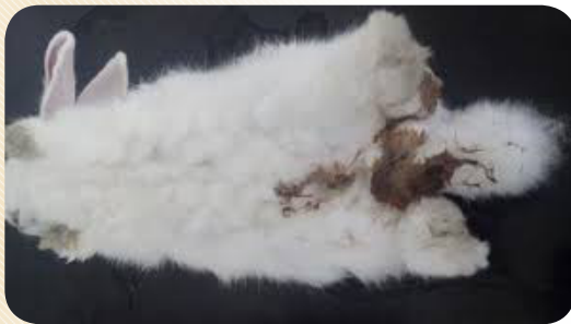
Rabbit with diarrhoea