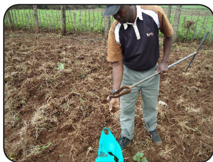
Sampling using an soil auger

Soil sampling is the practice of obtaining soil from the field for the purpose of determining its physical, chemical and biochemical characteristics before undertaking any land use activity on it.