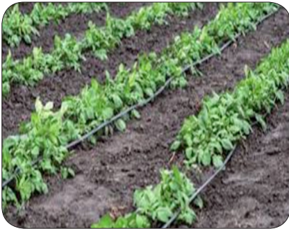
Drip Irrigation in potatoes