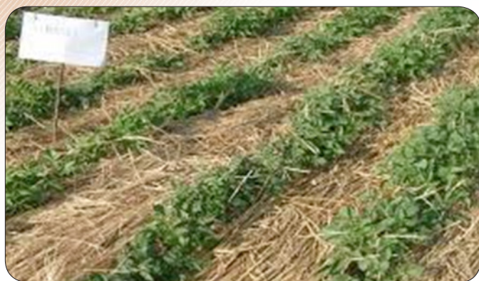
Mulching Potato Crop