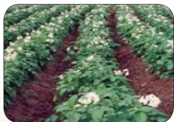
Furrows in Potato crop field

Furrow irrigation uses furrows between planted ridges. The soil is prepared into vertical channels (furrows) and planting mounds. Water moves into each furrow, running down the furrow's length and seeping into the soil at the root level. Furrows and ridges are popular in potato-growing regions.