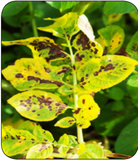
Yellowing of mature leaves near veins