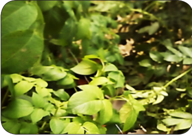
Curving and yellowing of leaves