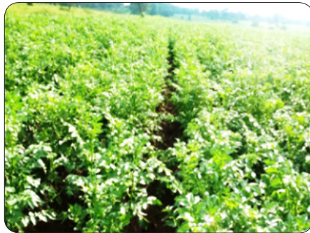
Potato crop showing good vegetative growth