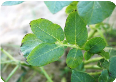
Grey patches on leaf margins