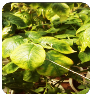
Yellowing of leaf margins