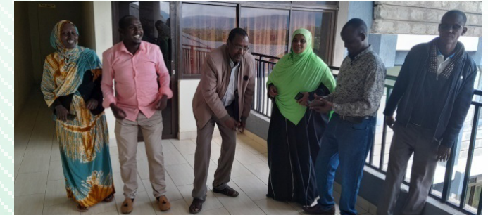
A group song in FFBS

This group is illustrating through a song, how a community celebrates after a bumper harvest, showing the impact of effective communication.