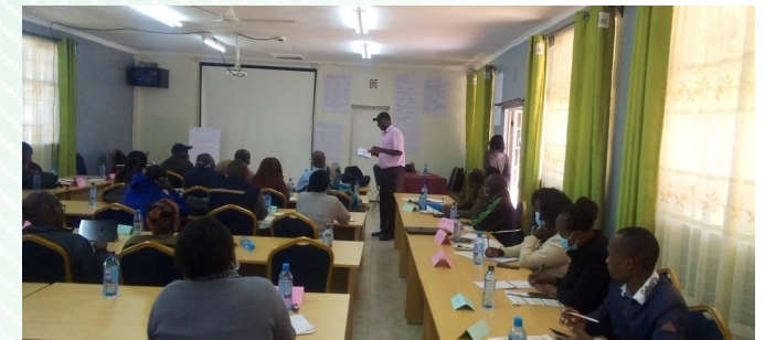
Lecture in a hall

Lecture: Lecture is where facilitators give information to participants as a means of communication