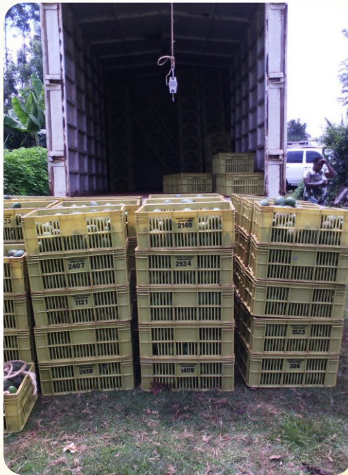
Loading of Avocado fruits in crates for transportation to a processing area

Selecting the appropriate crate is crucial for ensuring the successful shipment of products, as it directly impacts packaging quality and product safety during transportation. Opting for the correct type of crate among various options can result in cost savings while maintaining the integrity of the goods being transported.