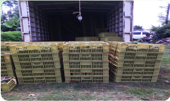
Normal Crates