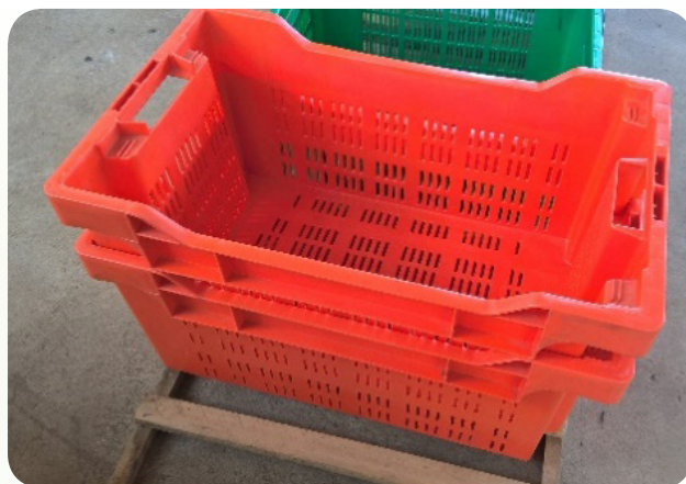
Nestable crates Collapsible

Note: Nestable and collapsible crates are space-saving version that should be promoted for transporters