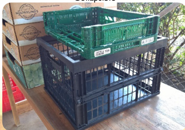
Collapsible crate