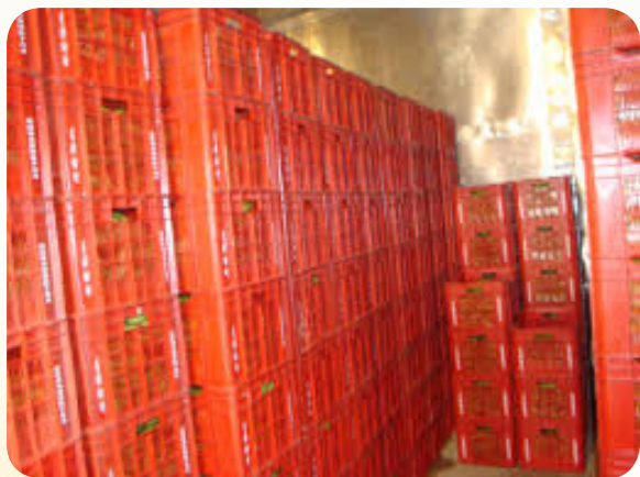
Packhouse Cold Room

A packhouse is a facility where harvested crops are consolidated and prepared for transportation and distribution to various markets. Various operations take place here which include: cleaning, sorting, grading, pretreatments, packing, cooling , storage and dispatch to the market. Cooling is done by use of cold rooms which have controlled temperatures.