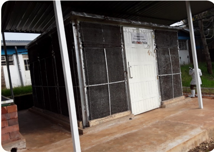
Evaporative charcoal cooler for avocado

The charcoal cooler consists of a double brick wall filled with charcoal in between, and, a storage chamber. The charcoal is kept moist with water. The inside chamber is cooled through the water in the charcoal.