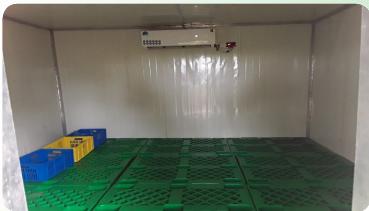
CoolBot™ Technology