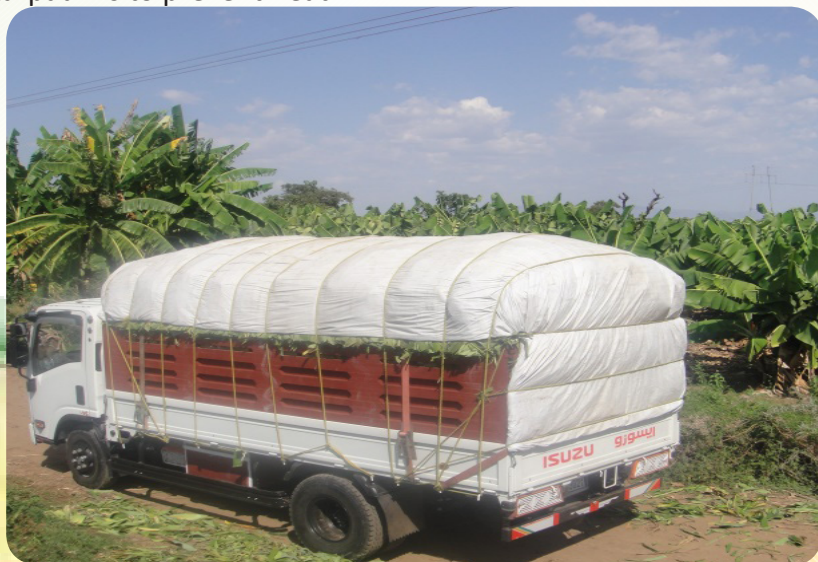
Transport of Avocado with a Lorry Covered with Tarpaulin

These are types of coolers that use covers, umbrellas, booths, tents and also transport vehicles covered with light colour tarpaulins to prevent heat.