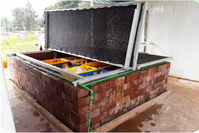
Evaporative cooling- Zero energy cool chamber