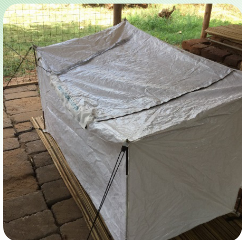
Wakati™ technology