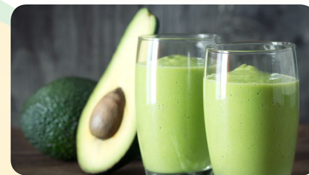
Ready to drink avocado juice