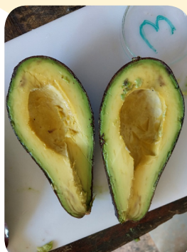
Avocado cut into half ready for pulping