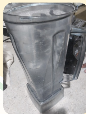
Blender for pulping avocado