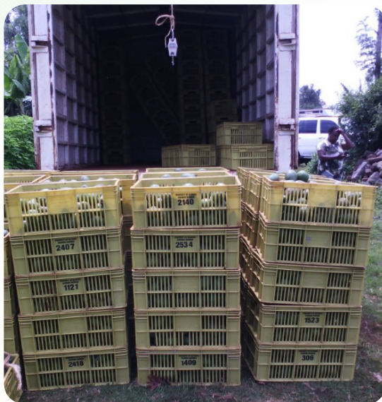
Avocados packed in crates for transportation to packhouse

Empty the produce in crates for transport to the packing house.