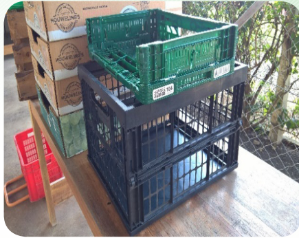
Foldable Crates