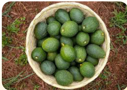
Harvested avocado in a basket