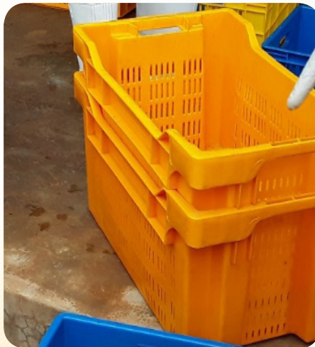
Nestable or Stackable