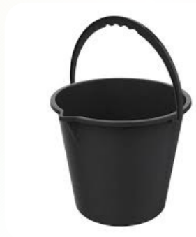
Bucket for harvesting avocado