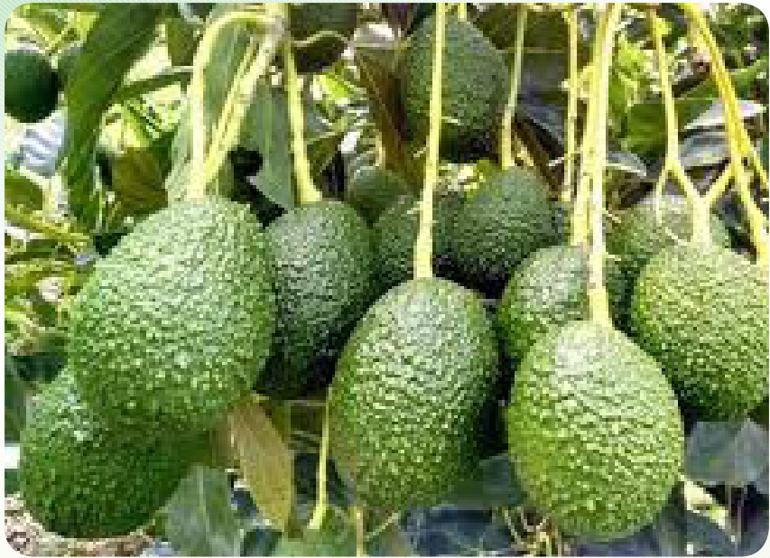
Mature avocado fruits ready for harvesting