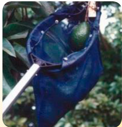
Fruit harvesting net