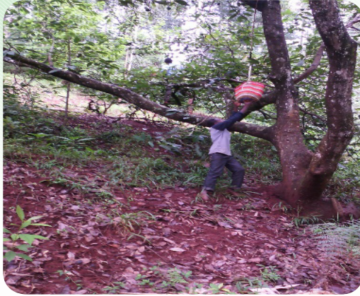
Avocado Harvesting Basket