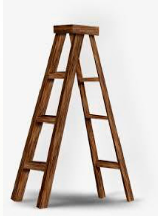
Avocado harvesting ladder

Manual harvesting is done by standing on a ladder to pick them or use of a bucket and hook method or harvesting tool and should be done with utmost care to avoid mechanical damage. The Avocados are stacked in clean crates ready for transportation.