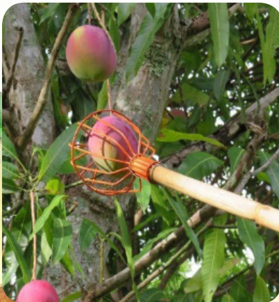
Fruit harvesting stick