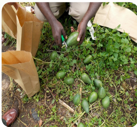
Stalk of harvested avocado fruit been trimmed to 8-10 mm

Avocado fruits are mostly harvested between April and September in Kenya. Since most varieties do not change colour on maturity, a few fruits should be picked and stored at room temperature for 7-10 days. If they soften without shrivelling, then the fruit is ready for harvesting. Fruits should not be pulled from the stalk but be cut off leaving 3 cm stalk and then trimmed to 8-10 mm stalk before transporting to the packhouse.