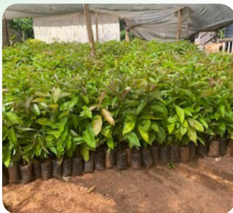
A stack of avocado seedling in a nursery