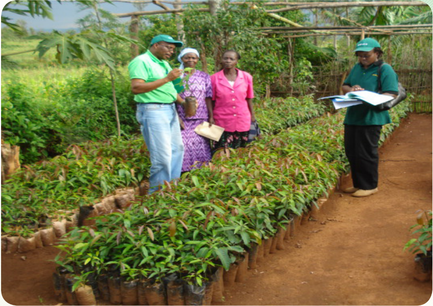
A nursery inspection session