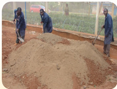
Soil and sand mixing for a soil compost sand media