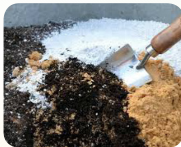
Coco peat (dark), perlite, (brown) and lime (white) mixing for the perlite coco peat sand media